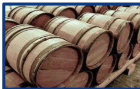
Barrels of Gunpowder