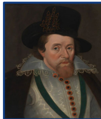
King James I