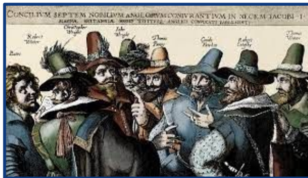
Guy Fawkes and his plotters